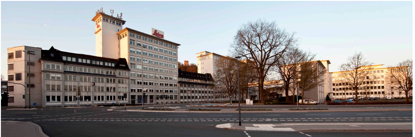
Present view of factory buildings used by Leica Microsystems and the municipal building (Rathaus). Company headquarters of Leica Camera AG are located in the Leitz Park in Wetzlar.