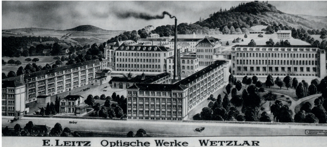
Leitz factory around 1900

The Leica Microsystems still has its headquarters in Wetzlar.