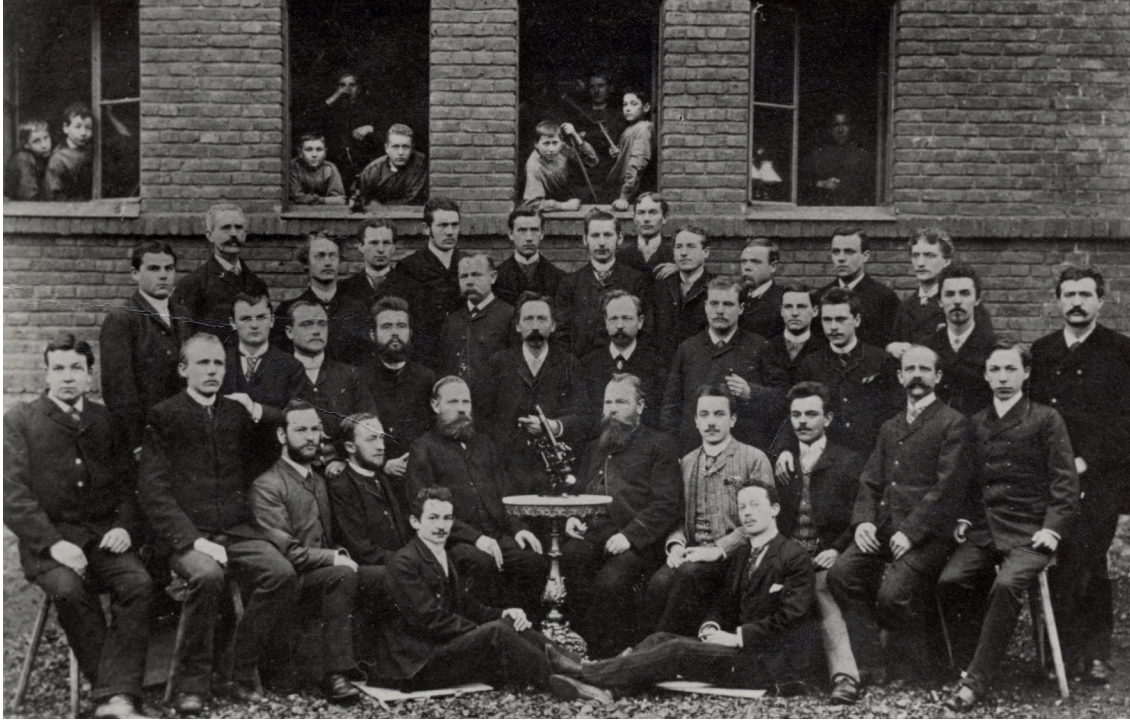
Employees of the Seibert Company around 1892

The property belongs to the Lahn Dill Kreis since 1975. The factory buildings located behind were at last used by the Leitz Company and torn down 1977.